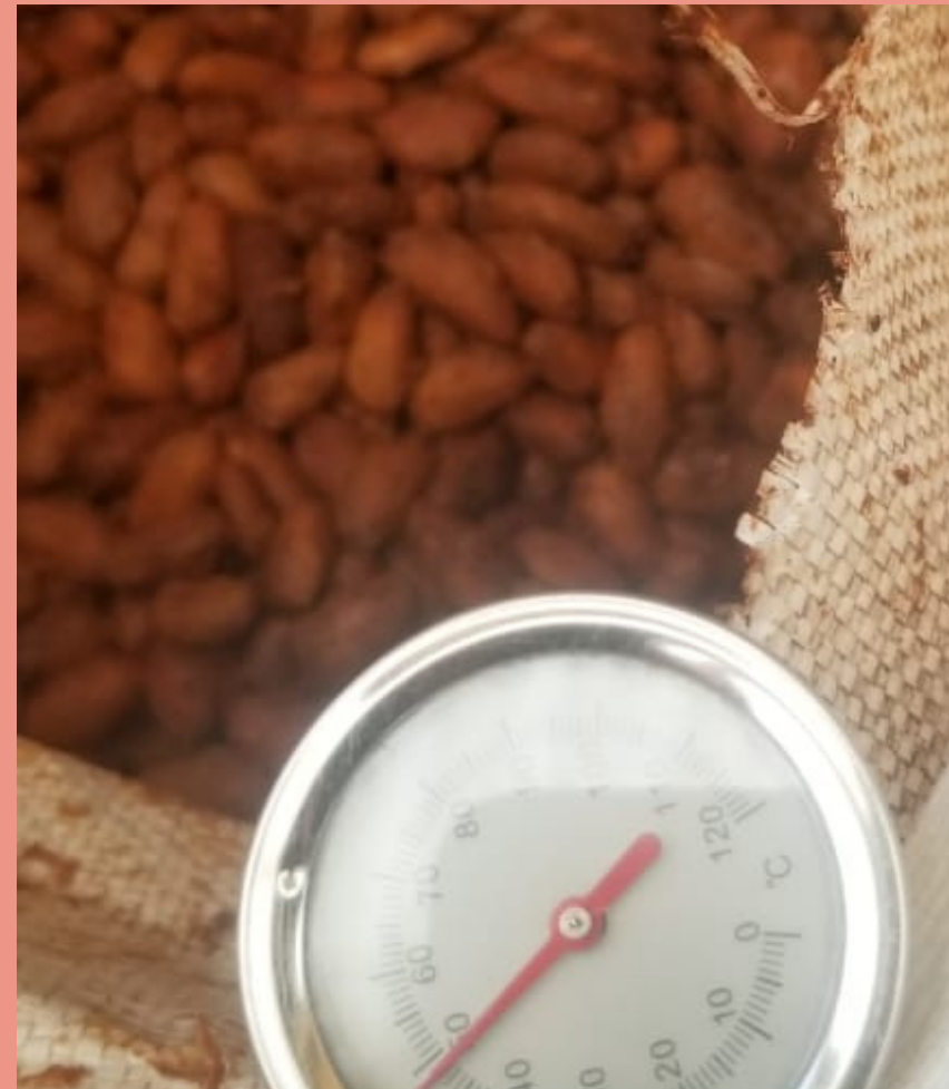
3. Fermenting cocoa