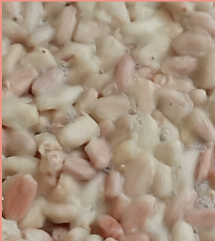
2. Wet cocoa